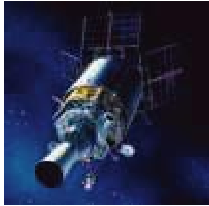
Defense Support Program satellites provide early warning of a missile attack.

Proper use of ISR assets is critical to the planning, conduct, and assessment of nuclear operations. ISR affords the commander the ability to gather information and make decisions in a timely fashion. Warning systems must be in place that allow civilian leaders to determine if a nuclear response is appropriate. Planners must have the means of finding decisive targets and determining the proper weapon to employ. Post-attack assessment of both friendly and enemy capabilities is essential for determining the need for and ability to conduct follow-on attacks.