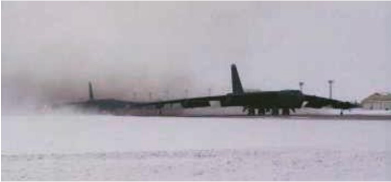
B-52s perform minimum interval takeoffs in response to tactical warning.

possible that communications may be degraded to the point that it is difficult to pass critical information or send orders to the field.