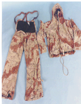
Figure 4.4-1. Joint Service Lightweight Integrated Suit Technology (JSLIST)

The wearing of individual protective equipment can hinder performance by interfering with vision, communication, and dexterity. High ambient temperatures are particularly devastating to those required to don protective clothing. With training, many of the negative effects can be minimized. Overheating, however, is difficult to overcome. In hot weather, full protective gear is very burdensome. Even the threat of agents can dictate the donning of gear. Commanders must then consider limiting the duration of operations or elect to compromise the protection afforded by individual gear. Figure 4.4-1 shows the newest U.S. protective clothing.