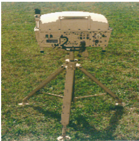
Figure 4.3-2. RSCAAL

Historically, detection of ground and surface contamination has depended on a color change on special paper that was exposed to an agent. Another method was a color change that occurred when air was drawn through tubes with special dye chemicals on a substrate. Special analytical kits were used to determine the presence of chemical agents in water. Various technologies are used in automatic detectors. All of them indicate the presence of an agent in one location. A number of detectors are being developed to provide standoff capability. Figure 4.3-2 shows the U.S. Remote Sensing Chemical Agent Alarm (RSCAAL), which is designed to detect nerve and vesicant agent clouds at up to 5 km. If an agent can be detected at a sufficient distance, measures can be taken to avoid the contamination and the need to wear protective clothing.