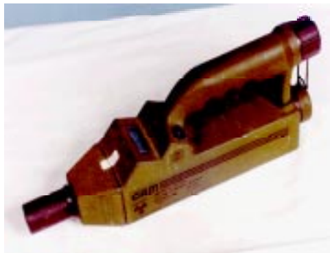
Figure 4.3-1. Chemical Agent Monitor (CAM)

Detection can be accomplished at a designated location (point detection) or at a distance (standoff detection). No single fielded sensor detects all chemical agents of interest. Standoff detection is particularly difficult for low volatility agents (e.g., either U.S. or Russian forms of VX). Sensitivity of a detector is crucial to detecting lethal concentrations. Equipment must be reliable, provide identification quickly with a low false alarm rate and high accuracy, and be integrated into an alarm system so that warning can be distributed and proper action taken. Unknown factors can include location, persistence, and intensity of the agent. These are critical parameters for command decisions. Figure 4.3-1 shows a U.S. Chemical Agent Monitor (CAM). Detection, warning, and identification have an offensive CW component and are also necessary in a defensive context.