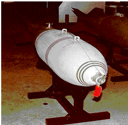
Figure 4.2-1. MC-1 Gas Bomb

Perhaps the most important factor in the effectiveness of chemical weapons is the efficiency of dissemination. This section lists a variety of technologies that can be used to weaponize toxic chemical agents. Munitions include bombs, submunitions, projectiles, warheads, and spray tanks. Techniques of filling and storage of munitions are important. The principal method of disseminating chemical agents has been the use of explosives. (Figure 4.2-1 shows an example of a U.S. chemical bomb, the MC-1.) These usually have taken the form of central bursters expelling the agent laterally. Efficiency is not particularly high in that a good deal of the agent is lost by incineration in the initial blast and by being forced onto the ground. Particle size will vary, since explosive dissemination produces a bimodal distribution of liquid droplets of an uncontrollable size but usually having fine and coarse modes. For flammable aerosols, sometimes the cloud is totally or partially ignited (flashing) in the dissemination process. For example, explosively disseminated VX ignited roughly one third of the time it was employed. The phenomenon was never fully understood or controlled despite extensive study. A solution would represent a major technological advance.